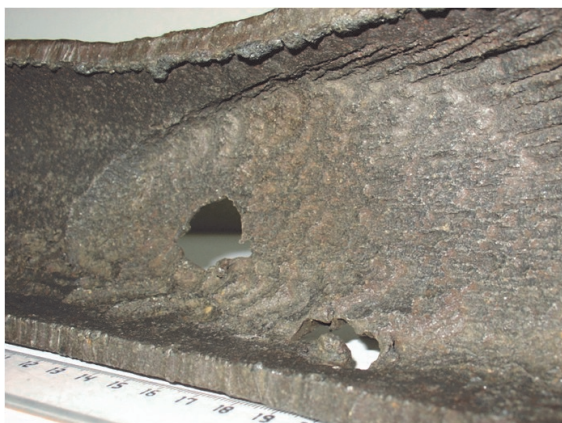
A fuel line corroded by Fungus

A by-product of this bacterial break down is the creation of organic sulphuric acid that scours any surfaces it comes into contact with. This creates corrosion debris and tank corrosion. Anaerobic organisms, known as SRB’s or sulfate reducing bacteria are referred to as “metal-eating bacteria”.