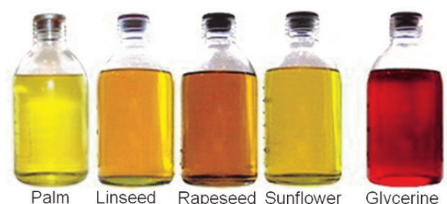
Palm Linseed Rapeseed Sunflower Glycerine

Unfortunately, natural fats are too viscous to be used in high-performance, low-emission diesel engines, so, a process is used to change the natural fat using methyl alcohol and a catalyst into the Fatty Acid Methyl Ester (FAME).