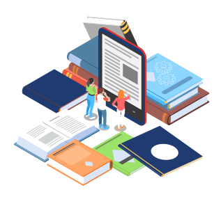
A WHOLE RANGE OF PUBLICATIONS PRODUCED