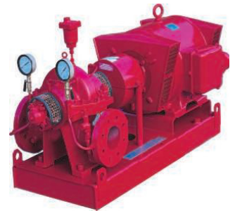
Split case electrically driven pump