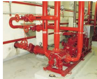
Multi stage/Multi Outlet pump in a high-rise building