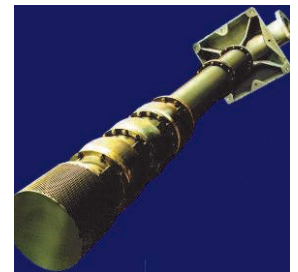
Vertical Turbine pump

The package requires the pumps to be installed within custom built housing with all the necessary pipework, valves, test lines, louvres, heating and lighting normally supplied in a conventional site-constructed pump house. The pre-assembled units are designed in accordance with the applicable fire rules and regulations and where necessary the applied national construction standards. With all the associated advantages, the factory assembled, and tested pump house has become much more convenient to install for both the end user and contractor. The completed unit is offloaded directly on to a pre-cast plinth and the contractor simply needs to secure the unit to the plinth, provide the electric supply into the pump house and pipe in the water supply.