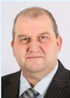
Minister for Housing and Regeneration, Carl Sargeant

It is understood that those responsible for a range of separate social housing projects, covering around 180 units across Wales, have already asked to be involved in the trial. ❖